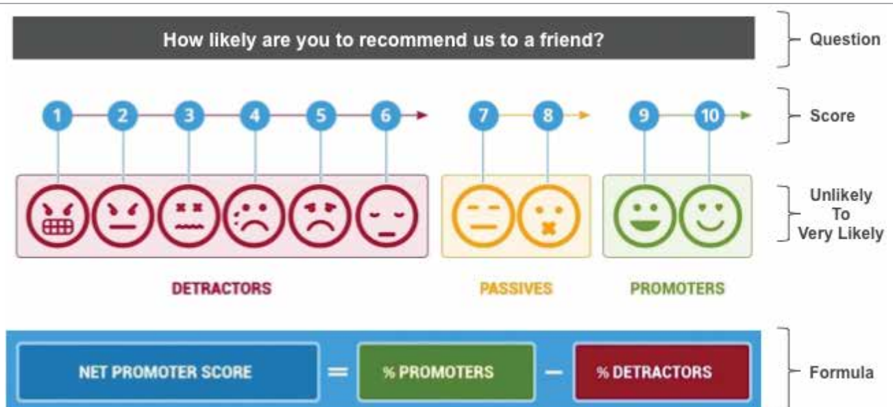
Exhibit 2 NET PROMOTER SCORE