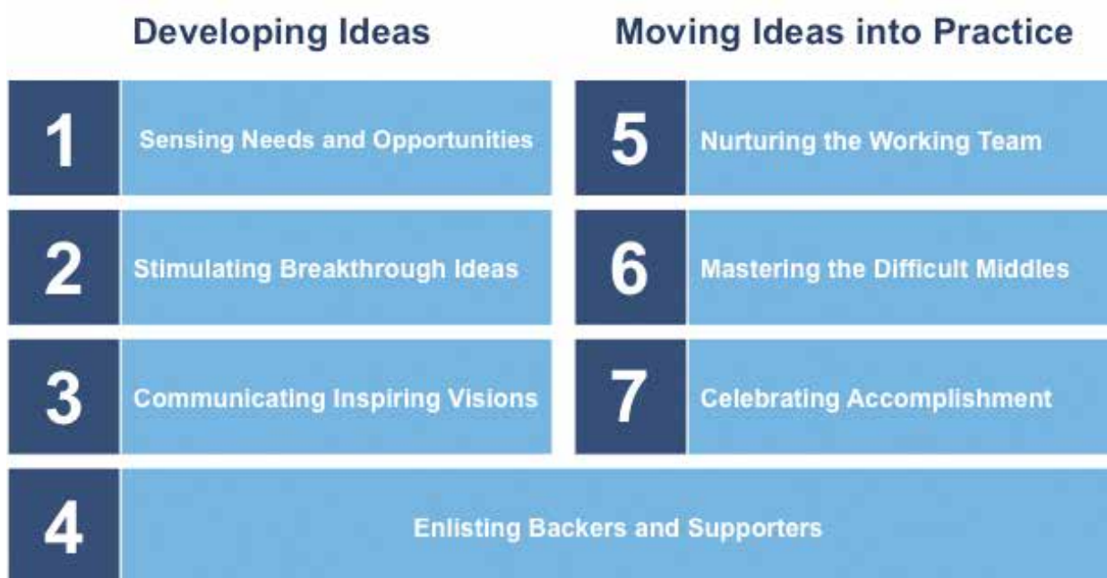
Exhibit 1 SEVEN FUNDAMENTAL SKILLS FOR ENTREPRENEURIAL LEADERSHIP

Source: Adapted from Rosabeth Moss Kanter's Principals as Innovators: Identifying Fundamental Skills for Leadership of Change in Public Schools , Public Education Leadership Project at Harvard University, December 13, 2016.