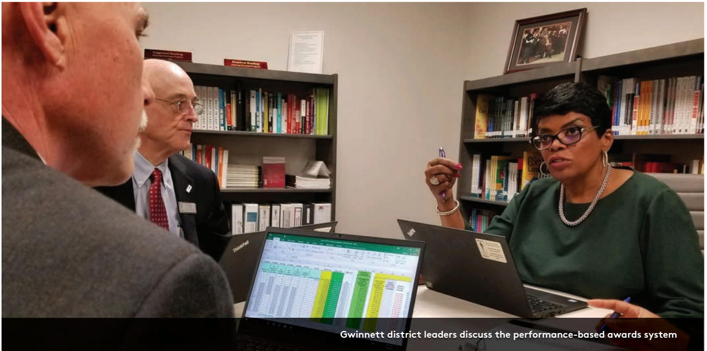
Gwinnett district leaders discuss the performance-based awards system

initially would apply only to classroom teachers and would exclude staff such as speech language therapists, coaches, and others.